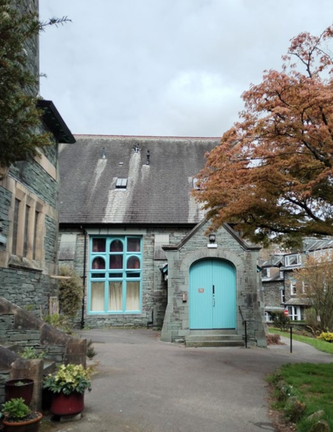
Ambleside Parish Centre – An Anglican Methodist partnership, part funded by the sale of the chapel.